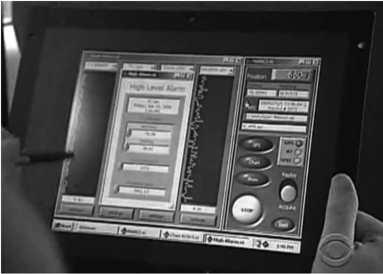
Figure 3. CBS’s report on counter nuclear terrorism efforts at the 2008 Democratic National Convention featured operators at their counter-nuclear interfaces.

organizations, we can surmise from the discourse about nuclear terrorism that this deeper crisis of Western modernity motivates the rhetoric of nuclear terrorism—for in fact, as we have said, if Al Qaeda or another group were successful in the use of a nuclear weapon, it could be a consequence only of a highly sophisticated network of political associations, communications, fund raising, skilled engineers, willing operatives, and savvy strategists. Thus, nuclear terrorism would rest on a mirror image of Western modernity’s “legitimate” nuclear structure. That representations of nuclear terrorists in Western media consistently elide this reality suggests their function is less to inform publics about the dangers of nuclear terrorism and more to perpetuate the ideologies of Western modernity itself.