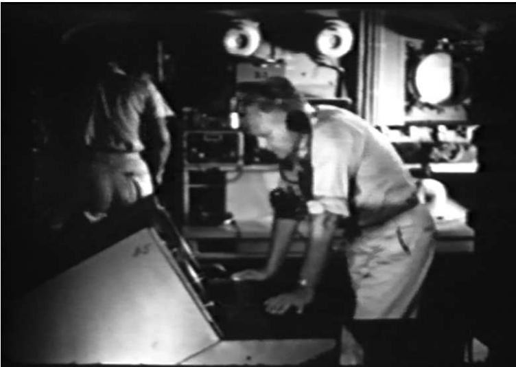
Figure 1. The nuclear operator at his interface control panel in Operation Ivy .

The film presents process and progress as co-constitutive. Having been shown by an engineer a flowchart of the test’s overall process, Hadley declares: “So that’s the